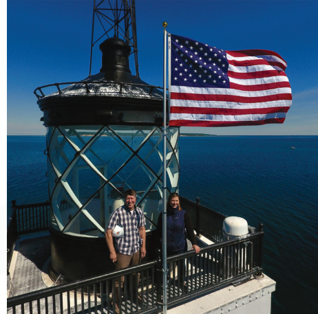
2021 Tours Begin! The Lighthouse welcomes its first guests to learn about the Crib's unique history.