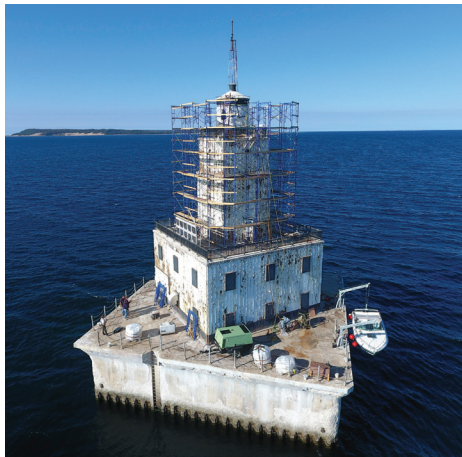
2017 NMLK contracts Mihm Enterprises to remove 35 years worth of bird guano, clean the interior, and begin to prime and paint the exterior.