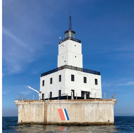
2018 The exterior painting is finished. The lighthouse's appearance has been restored to its former glory!