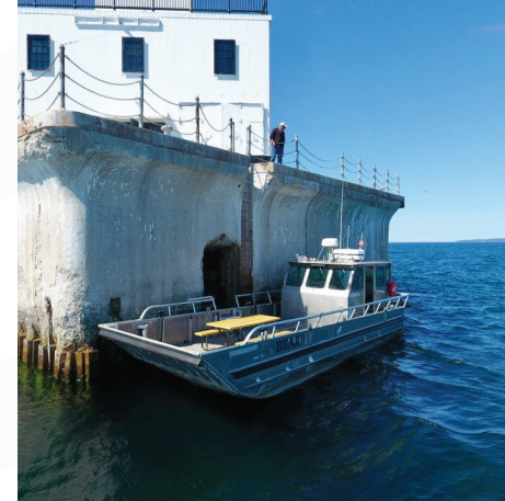
2022 Accessibility to the lighthouse is enhanced by the opening of the Sea Doors and use of BEAR, a 12 passenger landing craft. The third level deck roof is restored, further protecting the lighthouse from water intrusion.