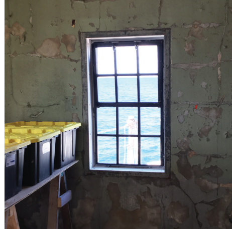
2019 Window and lens room glass restoration complete! Light fills the lighthouse once again!