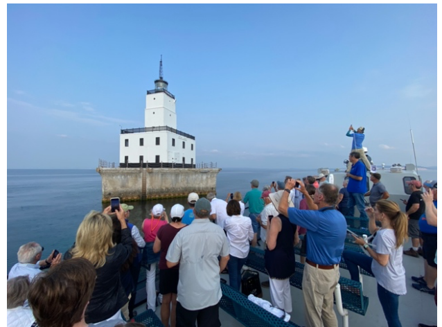
A beautiful evening for Crib Cruise!

Due to the overwhelming popularity and demand for tours, we also hosted a “Crib Cruise” in July on the Manitou Island Transit’s ferry, the Mishe Mokwa. We took 70 people on a sunset cruise to the Crib for a narrated viewing and tour of the lighthouse from the boat. The evening cruise was held after our annual “Light Keeper Rally” on July 23 and was a great success. The cruise turned out to be a nice alternative for folks who were unable to book a personal tour. We also plan to do more of these in 2022.